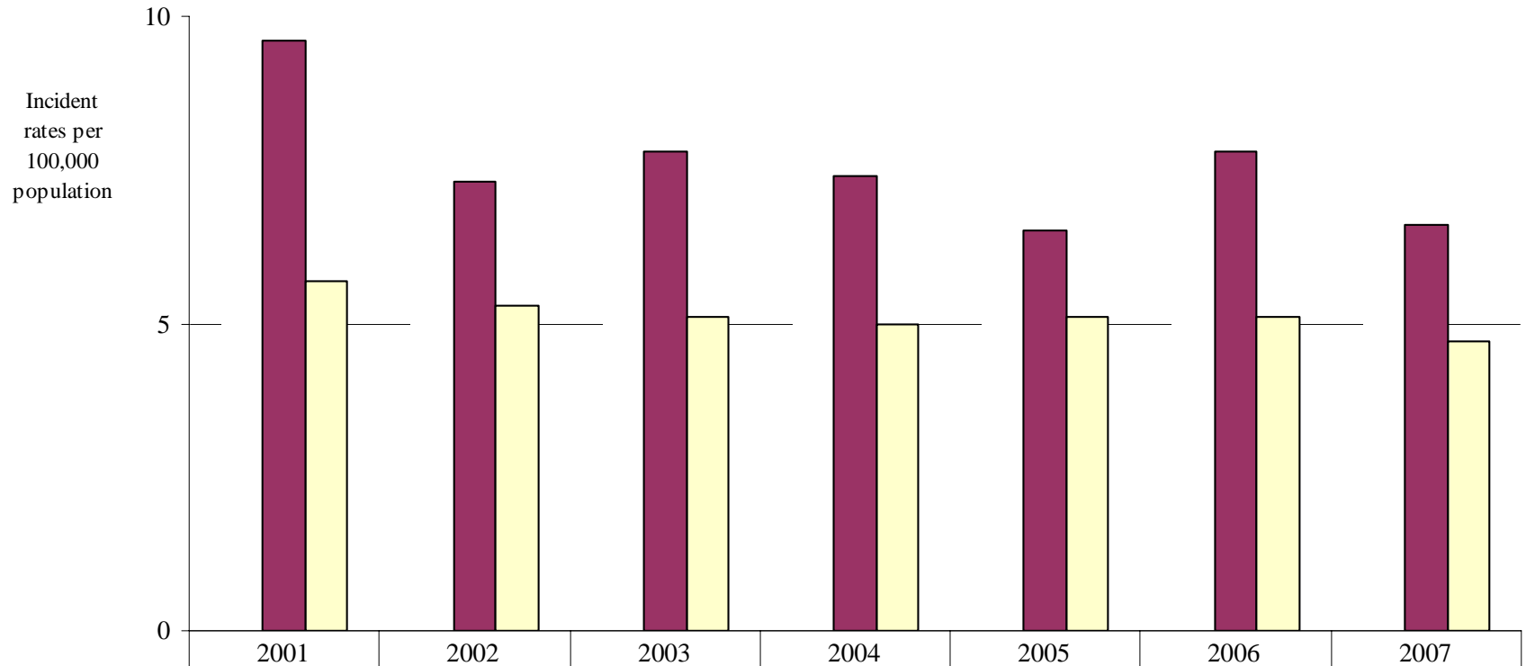
Tuberculosis incidence rates per 100,000 in BC and Canada, 2001-2007