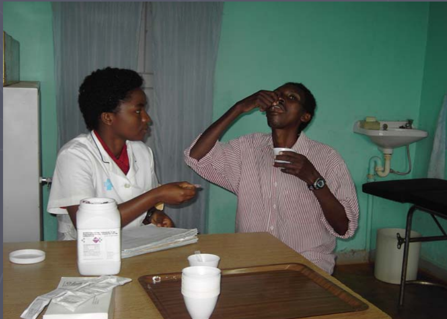
DOTS supervision in Rwanda