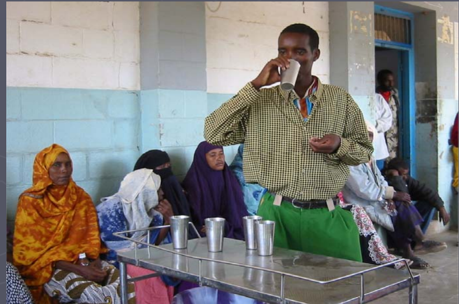
DOTS supervision in Ethiopia