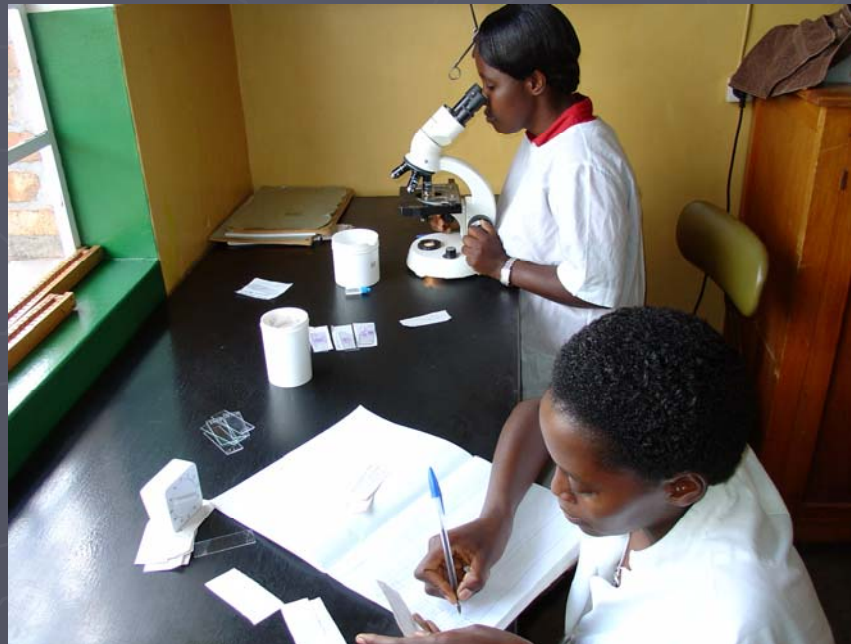
TB microscopy in Rwanda